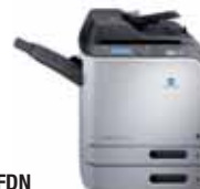
magicolor 4690MFDN magicolor 4695MFDN with optional lower paper feeder